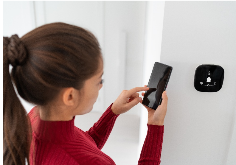
Smart devices like thermostats, electric vehicle chargers, and home batteries make it easy for you to participate.

The Power Response Smart Home Program provides financial incentives to participants for reducing energy usage during Energy Saving Events called by CPA. Conserving energy during this time can lead to lower greenhouse gas emissions.