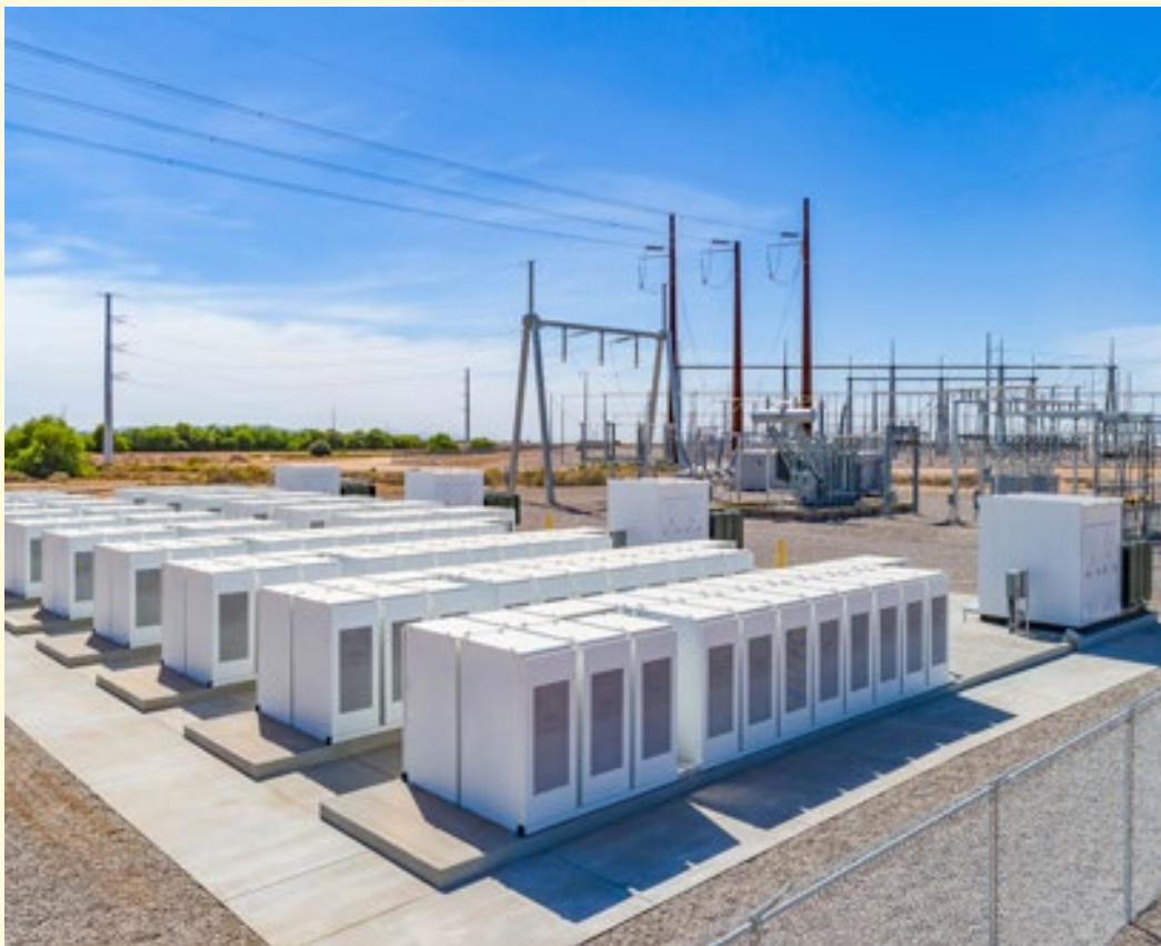
Pinal Central Energy Center, 10 MW battery energy storage system